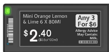
2.9 Inch ESL - Low Temp