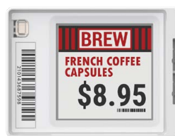
1.54 Inch ESL