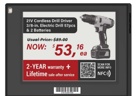
4.2 Inch ESL