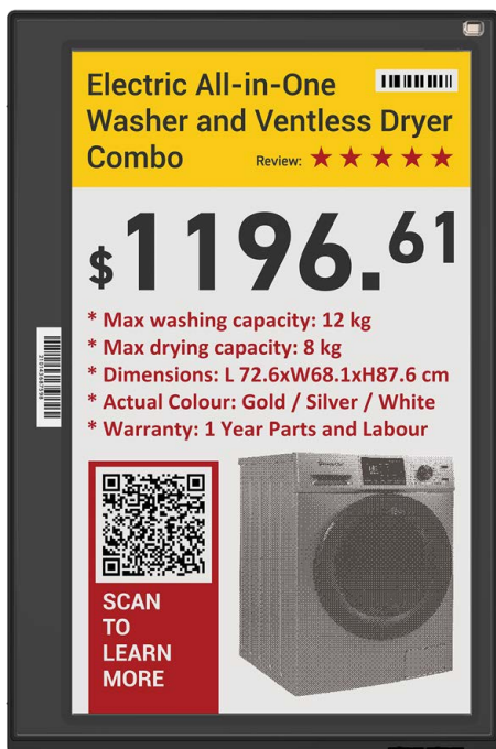
7.5 Inch ESL