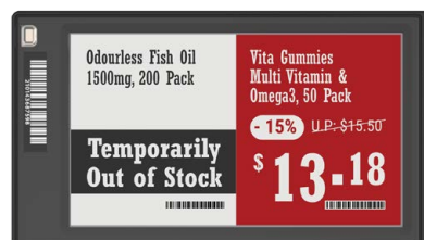
3.7 Inch ESL