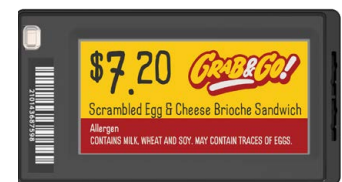
2.13 Inch ESL