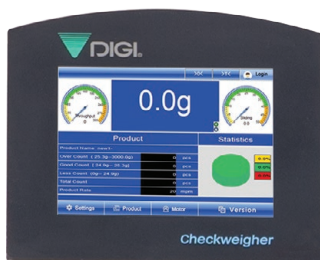
Checkweigher Operator Screen