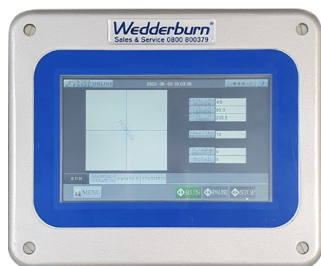
Metal Detector Operator Screen

* Actual conveyor speed will be dependant on product size